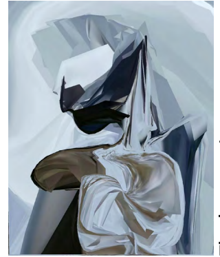
The last warrior Photography

This sale marks Liu Bolin's entry into the NFT world, as it is his first NFT-certified work.