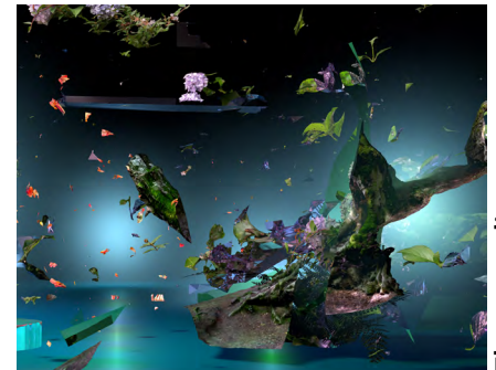
Florescendi 4K video

The artist plunges us into a speculative future, where samples of then-extinct plant species are preserved and exhibited in a virtual archive room. Through editing and visual strategies, this archive room sporadically transforms under the effect of the interference caused by the memory emanating from the listed plants, revealing the traces of a past that continues to haunt the place.