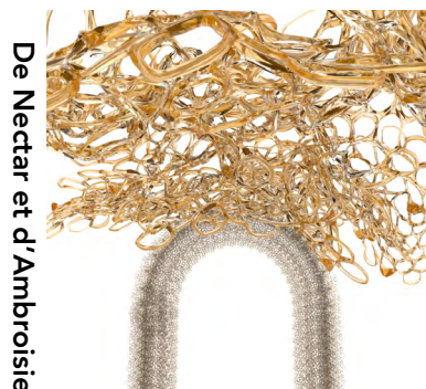
De Nectar et d'Ambroisie Interactive augmented reality experience

To see lot n°2, click here Est. : 10 000 € - 30 000 €